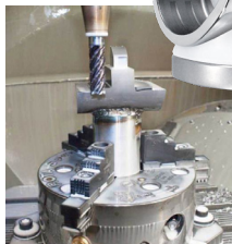
Scene from manufacturing process